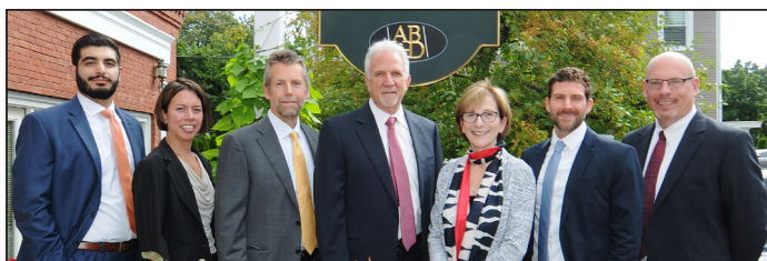
Abramson Brown & Dugan, Manchester

"We have been advertising in the New Hampshire Bar News for more than a decade and can definitely say it produces results through case referrals. It is also a great way to let others know the awards and accolades our lawyers are receiving for their hard work representing injured plaintiffs, so referring attorneys can rest assured that their clients are well represented by our office."