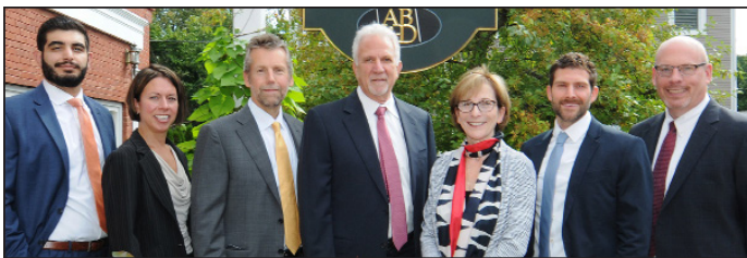
Abramson Brown & Dugan Manchester

“We have been advertising in the New Hampshire Bar News for more than a decade and can definitely say it produces results through case referrals. It is also a great way to let others know the awards and accolades our lawyers are receiving for their hard work representing injured plaintiffs, so referring attorneys can rest assured that their clients are well represented by our office.”