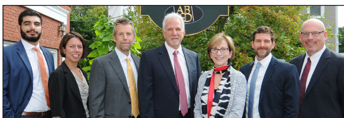
Abramson Brown & Dugan Manchester

"We have been advertising in the New Hampshire Bar News for more than a decade and can definitely say it produces results through case referrals. It is also a great way to let others know the awards and accolades our lawyers are receiving for their hard work representing injured plaintiffs, so referring attorneys can rest assured that their clients are well represented by our office."