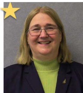
Martha M. Jacques Vickie M. Bunnell Award for Community Service